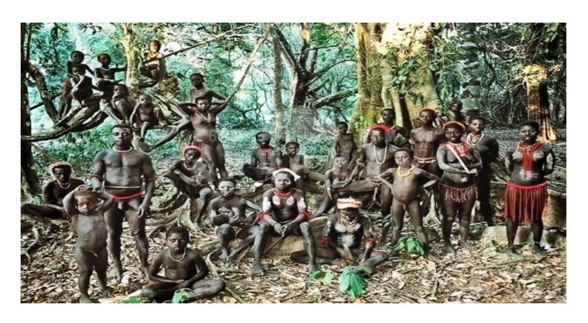
Fig 1: "Tribes of Andaman and Nicobar Islands." Go2andaman.Com , www.go2andaman.com/andaman-nicobar-islands/tribals-and-tribal-visits. Accessed 18 Mar. 2022.

dresses. However, some homemade ornaments with shells and palm leaves are worn by them though not in a sense to cover their nudity. The Jarawas lived in the south east part of Andaman but after the British regime they shifted to the western and middle Andaman regions.